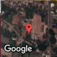
Kozhippara, Kerala, India Kozhippara P. O, Kozhippara, Palakkad, Kerala - 678557, Kozhippara, Kozhippara, Kerala 678557, India Lat 10.797362° Long 76.835697° 31/12/23 09:38 AM GMT +05:30