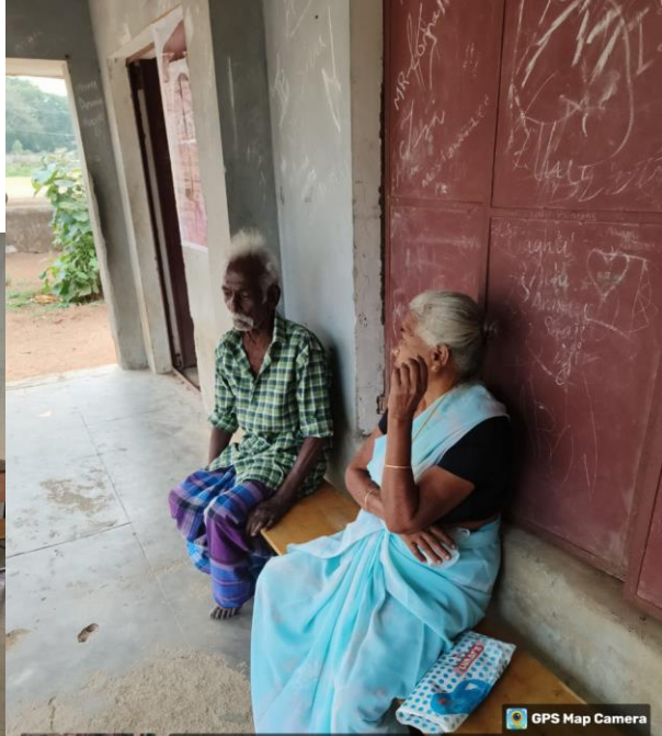
Kozhippara, Kerala, India Kozhippara P. O, Kozhippara, Palakkad, Kerala - 678557, Kozhippara, Kozhippara, Kerala 678557, India Lat 10.79737° Long 76.836068° 31/12/23 09:38 AM GMT +05:30