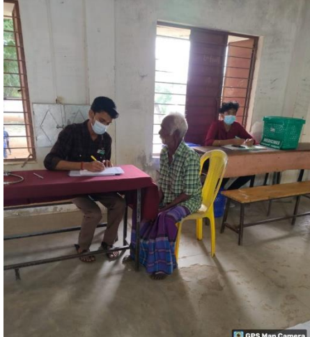
Kozhippara, Kerala, India Kozhippara P. O, Kozhippara, Palakkad, Kerala - 678557, Kozhippara, Kozhippara, Kerala 678557, India Lat 10.797376° Long 76.836077° 31/12/23 09:44 AM GMT +05:30